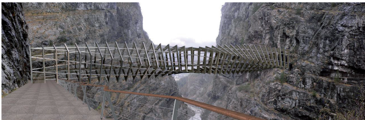
Fig. 2: Proposal for a footbridge above Vajont dam, Erto, Italy

Teaching bridge design is extremely important, both in Engineering and Architecture faculties. Bridges are “naked” structures, where form follows function.