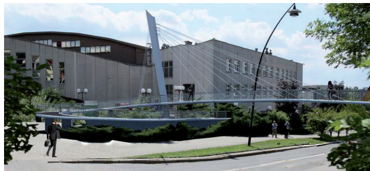
Fig. 1. Side view and visualisations of the footbridge in Jaworzno

The deck is a steel grillage consisting of two Ø355.6/25 tube girders braced by crossbeams made of HEB 200 beams (in the spans) and 2 HEB 240 or 2 HEB 260 beams (over the supports and near the pylon). The stays are anchored on both sides of the deck to short cantilevers made of steel tubes (in the main span) or to a box-section cantilevers (back stays). The steel grillage is composite with a 0.14 m thick reinforced concrete deck plate with use of headed shear studs welded to the crossbeams and longitudinal beams. Width of the deck plate varies from 3.50 m (typically) to 4.80 m (near the pylon).