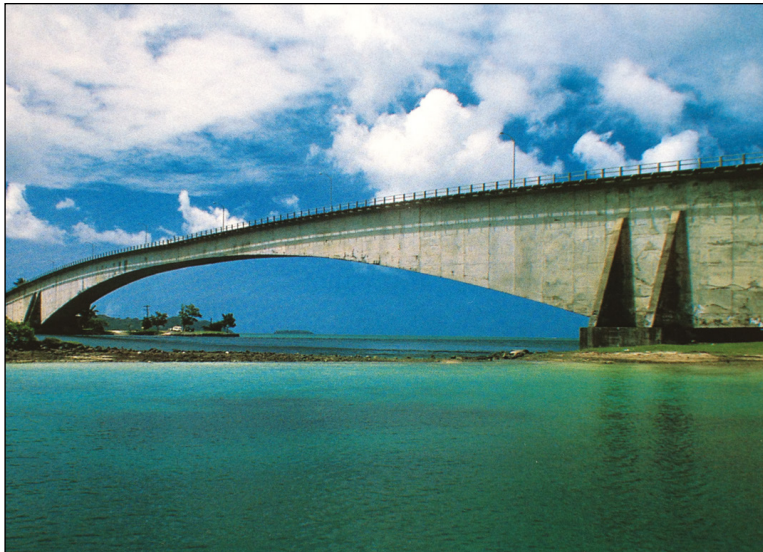
Fig. 24: Condition of bridge before repair (1996)