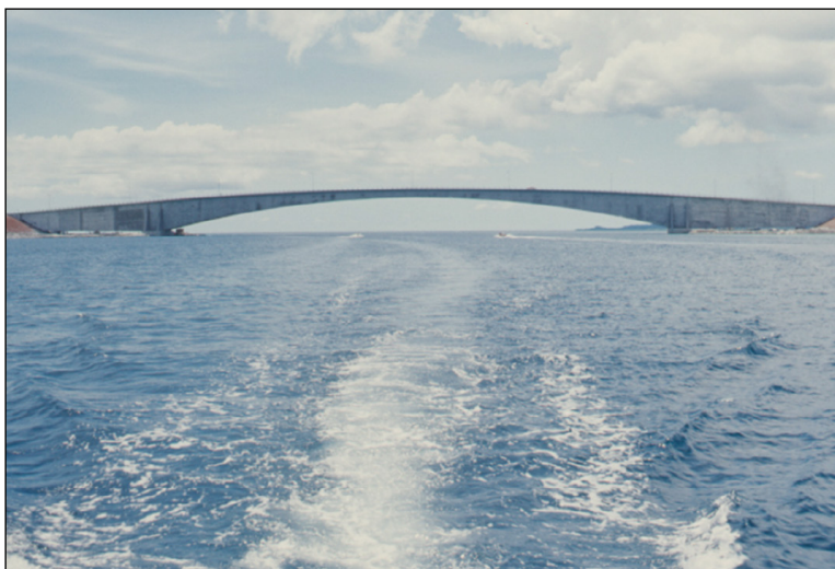
Fig. 1: Koror Babeldaob Bridge

When the islands were under US trusteeship, the US navy had a military base there. The construction of the Koror Bridge was, in part, financed by the US government.