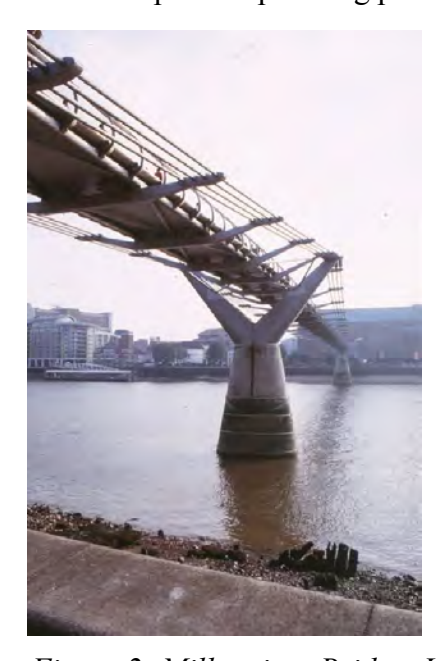
Figure 2: Millennium-Bridge, London