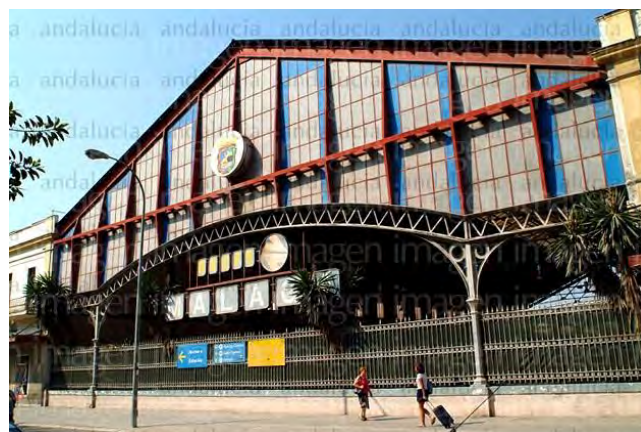
Figure 2. Former railway station