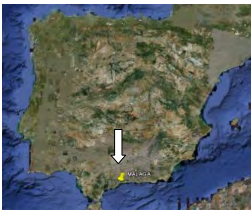
Figure 1. Location of Málaga in Spain

The complex includes a hotel of four stars called Barceló VIALIA, with seven floors and 222 rooms, with dimensions in plant of 48,00 m for 15,45 m, and with a height over the level of the street of 35,50 m. The Commercial Centre VIALIA includes also a parking with two underground levels whit a surface of 25.000 m 2 for 1300 parking places.